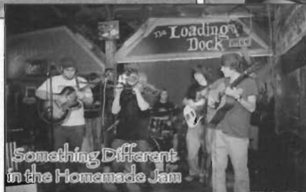
Something Different in the Homemade Jam

At the Harbor Springs Performing Arts Center